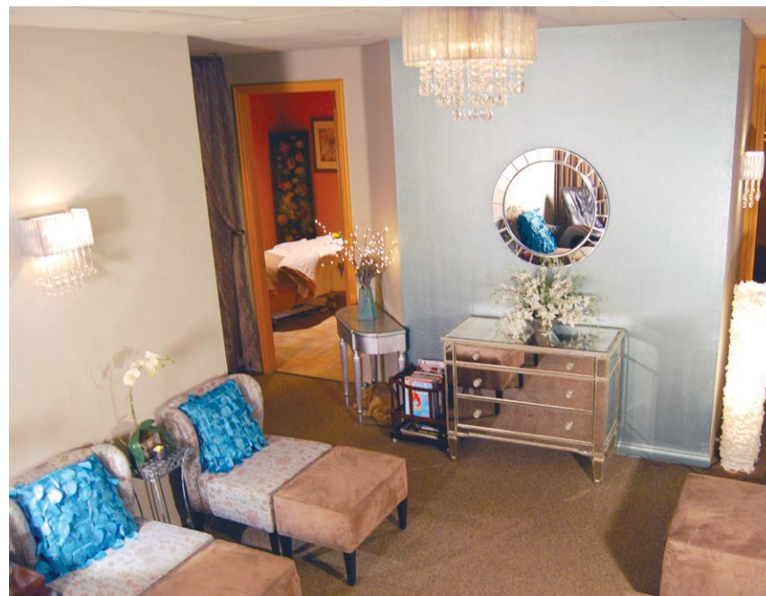
Spa Gregorie's quiet room.

"You recognize, reward and encourage your staff," she told me. "We love them as family members and try to keep a healthy and harmonious work-