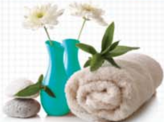
Prices Subject to Change