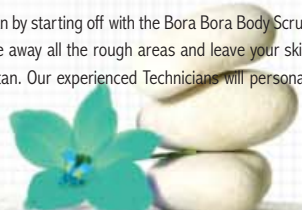
Prices Subject to Change

Buff & Bronze Package RSM ONLY Prepare your skin for the perfect spray tan by starting off with the Bora Bora Body Scrub. Using a tropical citrus body polish, we exfoliate away all the rough areas and leave your skin feeling silky smooth and ready to soak up the tan. Our experienced Technicians will personally apply your spray tan. $124